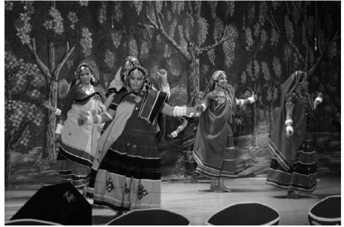
Lambadi Dance featured in a SiliconAndhra event

Most SiliconAndhra events provide an opportunity for aspiring artists to present their artistic skills to the community. Professionals in dance, music and literature